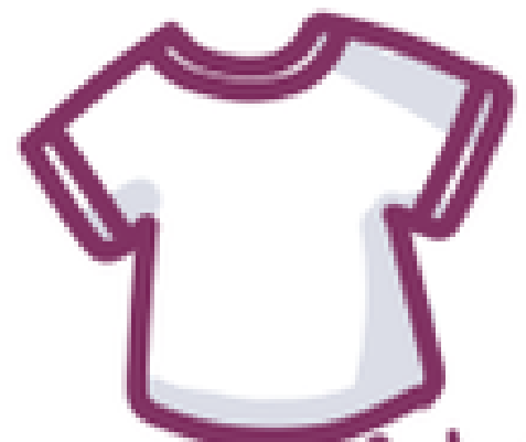
Big, comfy t-shirt