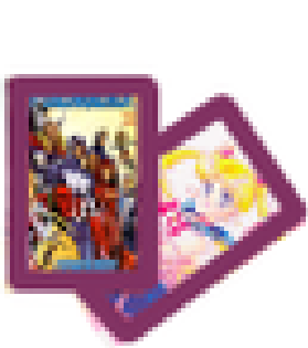
Books and comics