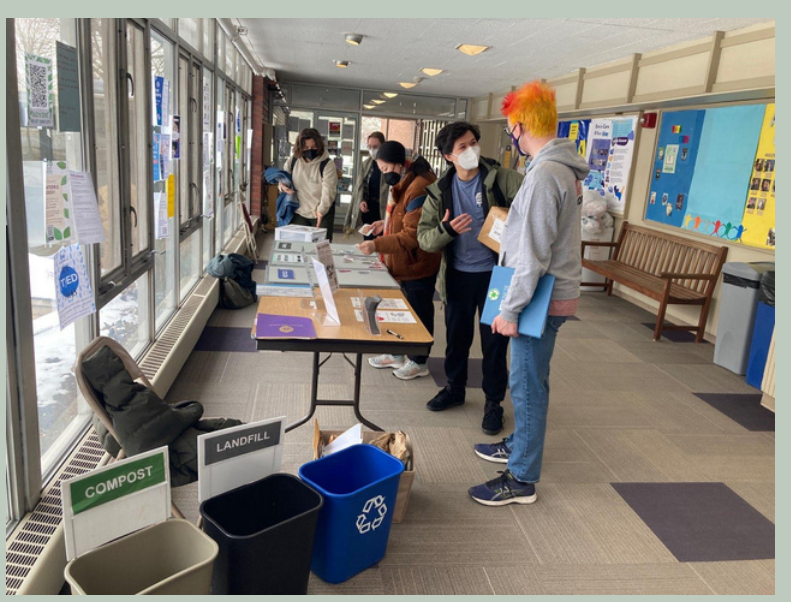
Over 30,000 lbs recycled materials diverted from the landfill during the 8 weeks of Campus Race to Zero Waste 2022

"I pledge to explore and take into account the social and environmental consequences of any job I consider and will try to improve these aspects of any organizations for which I work"