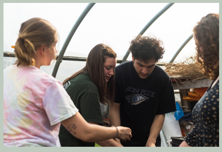
Seed Starting Event