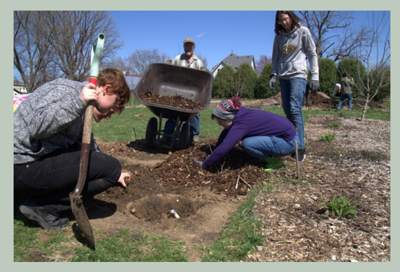
Presentation on Designing Resilient and Regenerative Community-Scale Systems at Growing Sustainable Communities Conference in Dubuque

Guild Planting Event for a Senior Research Project