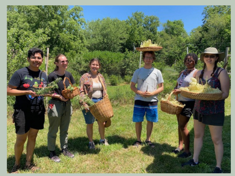
Bio-Regional Herbalism Research Group