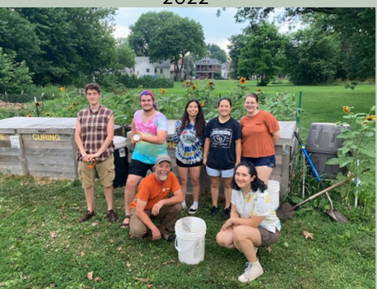
Community Composting Research Group and Knox Farm Workers composted over 1,200 lbs of plant material and food scraps in Knox farm Systems