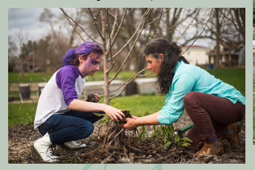
173 students signed the Green Ribbon Pledge of Social and Environmental Responsibility (87% of the Spring 2022 graduating class)

"I pledge to explore and take into account the social and environmental consequences of any job I consider and will try to improve these aspects of any organizations for which I work"