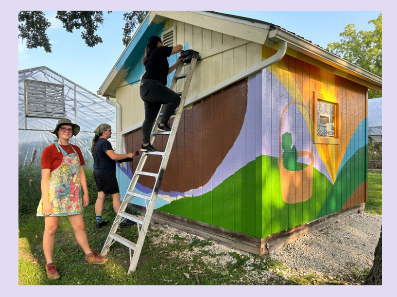
6 Research Projects, 15 Workshops and Special Events, including tours and plant and food giveaways