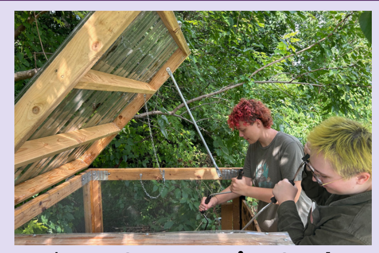
Three Community Scale Composting Workshops and over 30 participants divertiing 105.4 gallons of food scraps.