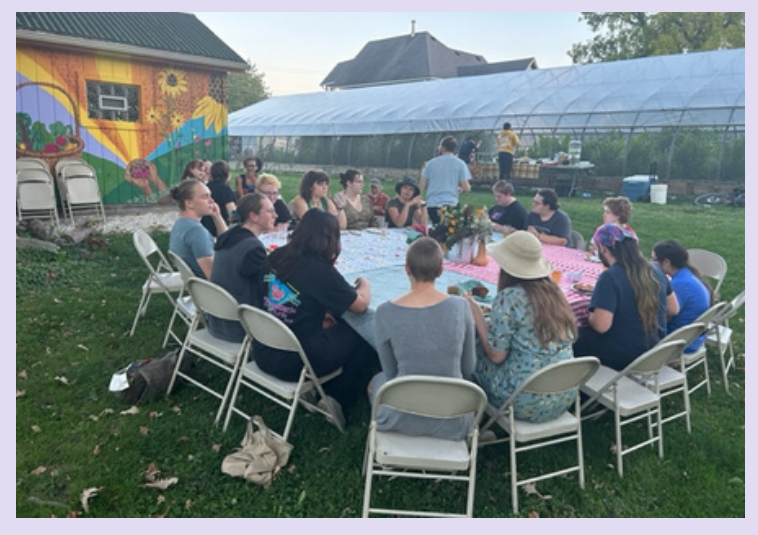
Three Farm-to-Fork Potlucks