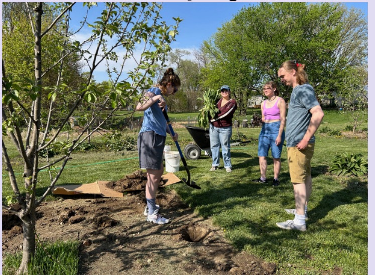
Arbor Day Herbal Fruit Tree Guild Implementation, planted three new species

Over 20,000 lbs recycled materials diverted from the landfill during 8 week National Campus Race to Zero Waste Campaign