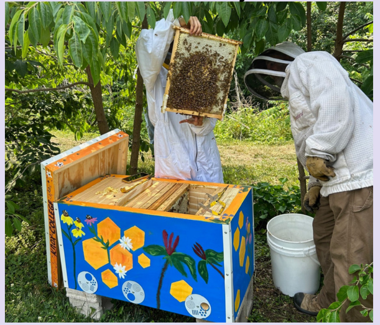
Art Installation and Community Mural as part of Asset Research