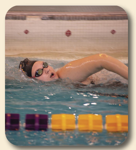
The men's and women's swimming & diving teams were selected by the College Swimming and Diving Coaches Association of America (CSCAA) as a Scholar All-America Team.