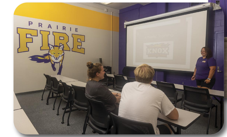
Enhancements in the athletic training room

Significant technological upgrades in the team film room and multi-purpose room