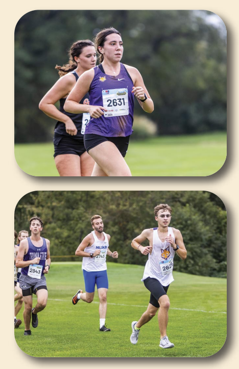
This year the cross country teams combined had 34 season personal records (PRs). The men's team moved up two places in the conference championships from 2019.