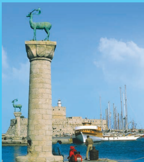
The bronze stag symbolizes the Colossus of Rhodes, one of the Seven Wonders of the Ancient World.

Cover photo: Admire the splendor of Santorini's whitewashed villages overlooking the deep turquoise waters of the Aegean Sea.