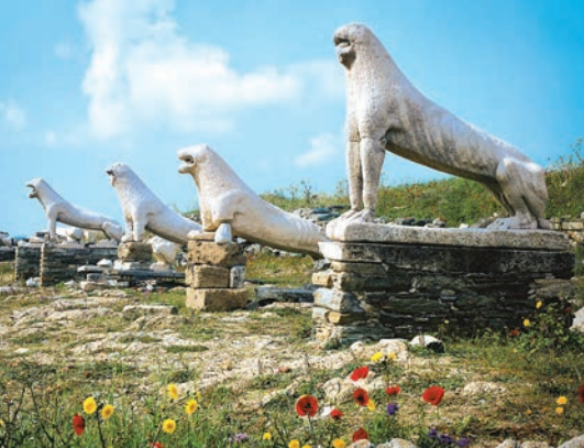
See Delos' UNESCO World Heritage site, the famed Terrace of the Lions, dedicated to Apollo before 600 B.C.

PRSR STD U.S. Postage PAID Gohagan & Company