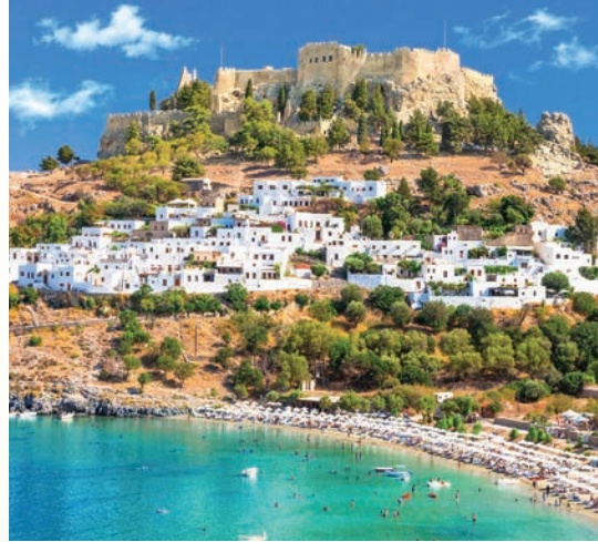
Be inspired by spectacular coastal views from the Lindos Acropolis, built 380 feet above the town.