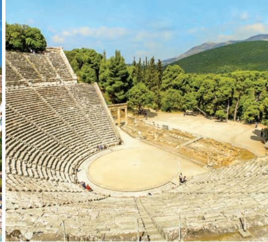
Enjoy the near-perfect natural acoustics of the theater at Epidaurus, built from 330-20 B.C. and still in use today.

cube-shaped houses and azure bays epitomize the striking beauty of the Greek Isles.