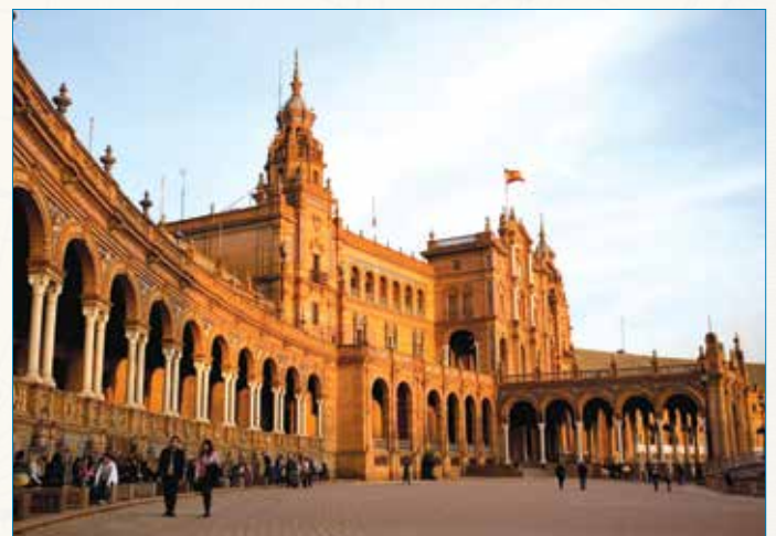
Seville's Plaza de España, built for the 1929 Ibero-American Exposition, is a masterpiece of Renaissance Revival and Neo-Mudéjar architectural styles.