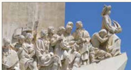
LISBON POST-CRUISE OPTION

The Travel Program outlined here is subject to the features, final pricing and terms and conditions set forth in the published Travel Program brochure. Upon receipt of the published Travel Program brochure, you will be given 10 days to reconfirm your reservation, at which time any deposit(s) will become subject to cancellation fees.