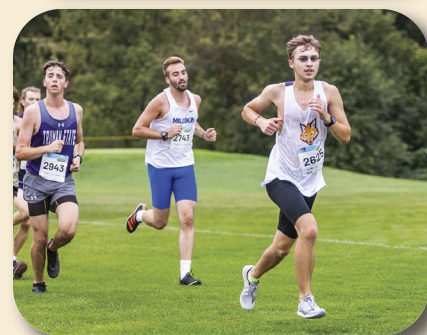
This year the cross country teams combined had 34 season personal records (PRs). The men's team moved up two places in the conference championships from 2019.