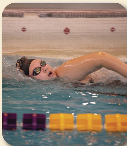
The men's and women's swimming & diving teams were selected by the College Swimming and Diving Coaches Association of America (CSCAA) as a Scholar All-America Team.