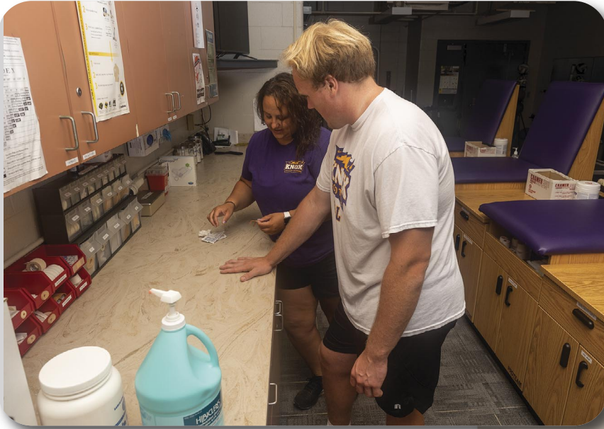
Enhancements in the athletic training room