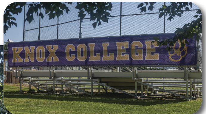
Branded windscreens for Blodgett Field and the Softball Field