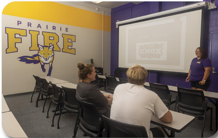
Significant technological upgrades in the team film room and multi-purpose room